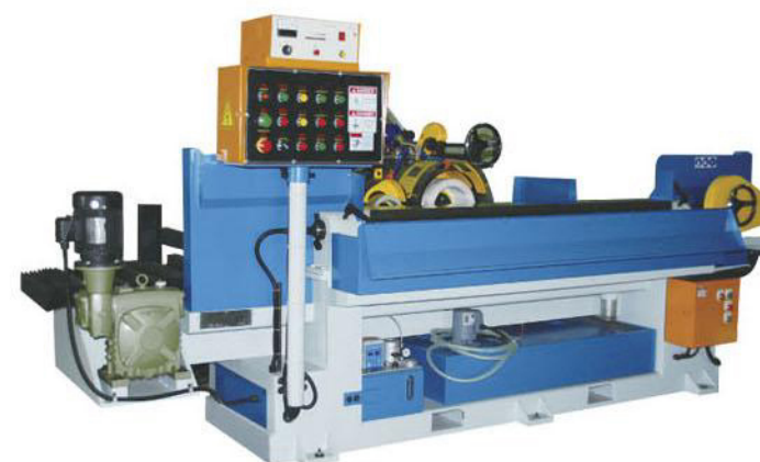
Scraper grinding machine