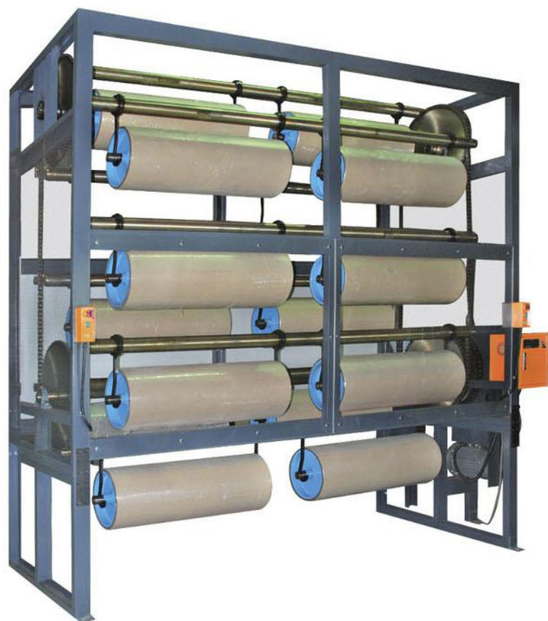
Rubber roller stock tower