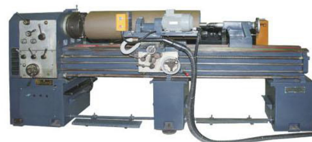
Rubber roller regrounding machine